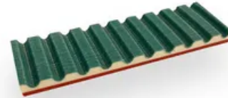
Green polyamide fabric