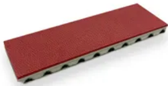
Standard TPU + Coating Linatex