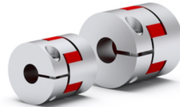
Recommended coupling bore diam. and transmissible torque (Nm) - valid for shaft tolerances k6 without keyway